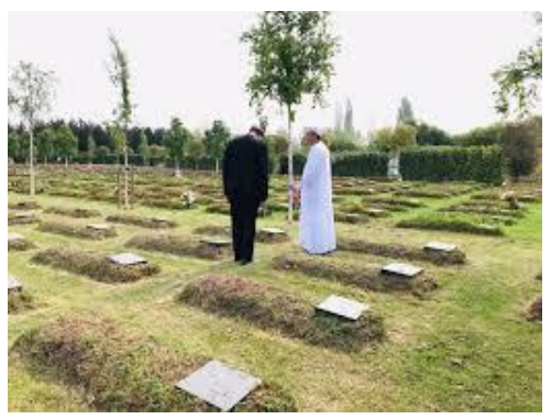
Gardens of Peace